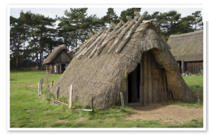
Recreation of an Anglo-Saxon house in Suffolk

After the invasion, people in the south and east of England settled into the Anglo-Saxon way of life. The Anglo-Saxons lived in small villages of huts and farmed the land. They were great craftspeople who used metal, wood, clay and precious stones to make weapons, tools, pottery, furniture and jewellery. When the Anglo-Saxons arrived in Britain, they were pagans, which means they believed in different gods. Over time, most Anglo-Saxons converted to Christianity. They spoke Old English, which developed from the language spoken by the Angles, Saxons and Jutes. Few people could read and write.