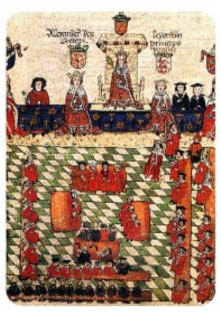
Edward I and the Model Parliament

The power of the monarchy has changed over time. In the past, some monarchs had absolute power. This meant that they could do whatever they wanted. Today, there is a constitutional monarchy. This means that the monarch is controlled by parliament